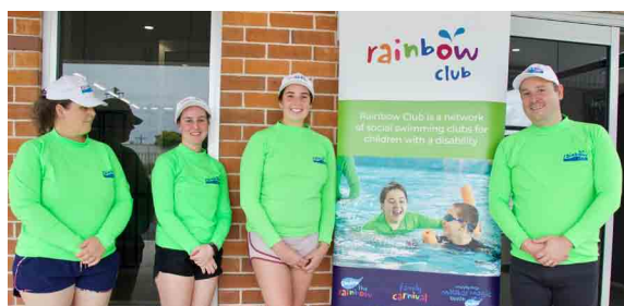
Narellan Rainbow Club opened in January 2020

Parents tell us it is the individual attention that helps their child with a disability learn to swim. Therapists recommend Rainbow Club for this reason. By February 2020 we had increased our capacity to 1000+ lessons each weekend – an increase of 15% in 9 months!